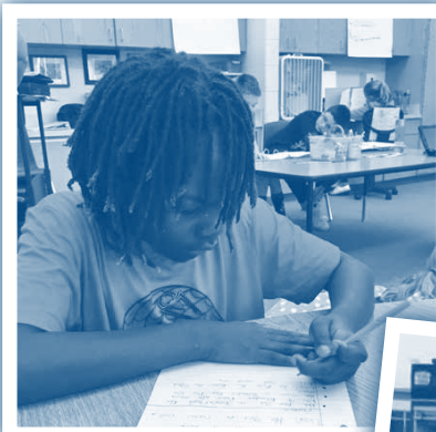
A student working hard to solve the problem in a story.

Thank you Howard Fire Department for teaching students at Howard Elementary about fire safety.