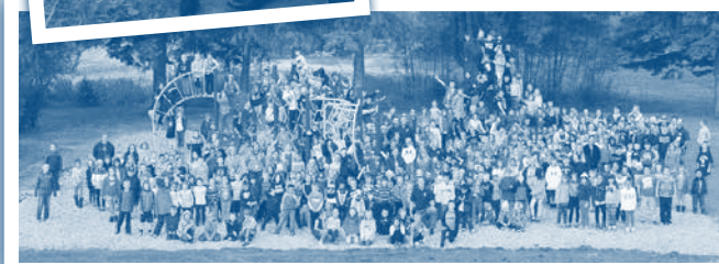
Our playground expansion is finished. Thank you to the Bay Harbor Parent Teacher Organization.